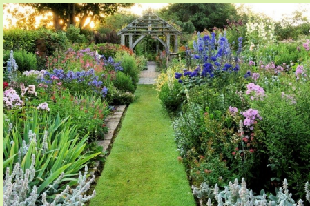
Wollerton Old Hall garden

Thursday 28 September – an introductory talk by one of the gardeners followed by a visit to the gardens at Wollerton Old Hall.