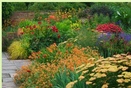
Wollerton Old Hall gardens

Each year the WPRA awards a small prize for the best looking front gardens. This year our theme will be summer colour.