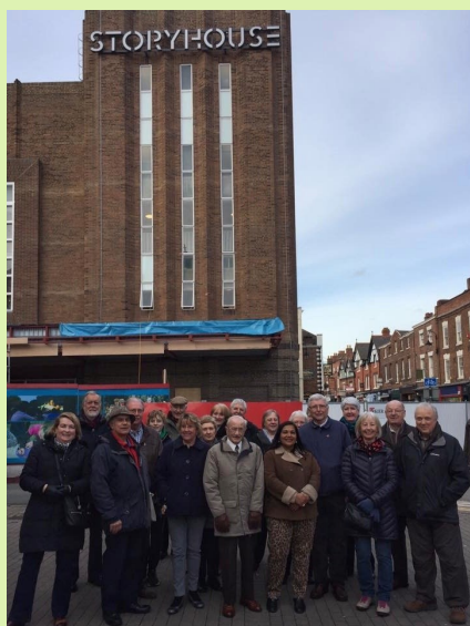
Visit to Storyhouse in April