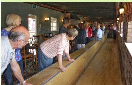
Twenty-six Evergreen members and their guests enjoying a game of skittles at the Bickerton Poacher.