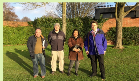
Changing room visit by our Councillors