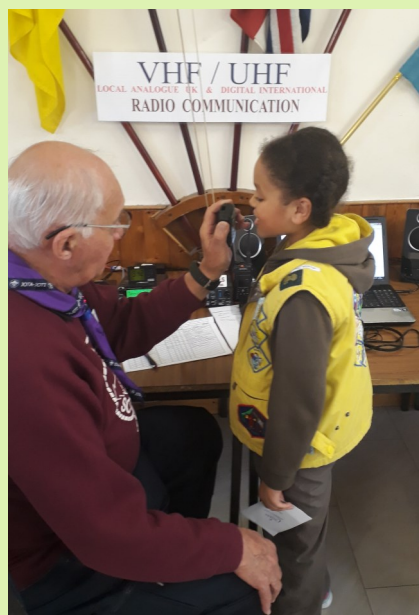
Taking part in the Jamboree on the Air