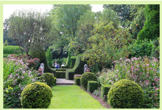
The Laskett Gardens

We look forward to seeing you at our next meeting.