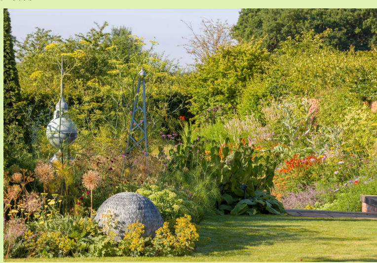
WP News/March 2019 3