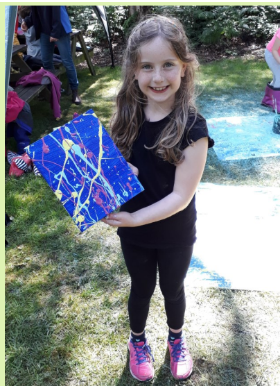
The girls had a memorable time and 'wanted it every weekend'.