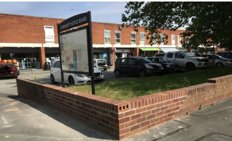
The newly repaired wall at the WP shops

We continue to get feedback about blocked drains, especially on Hough Green and Overleigh roundabout. We have reported these and by the time of this newsletter these should have been dealt with.