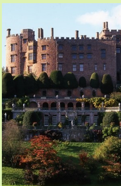
Powis Castle

We are hoping to repeat our annual bulb planting in late autumn. Volunteers have so far planted nearly 3,000 bulbs across the Westminster Park estate. As ever we are always delighted to have help. Please contact Mary Pole if you think you can spare an hour. pole.mary@gmail.com