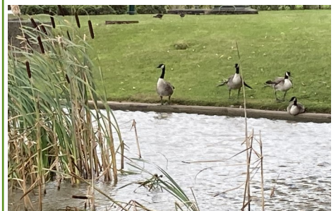
Goose on RHS has angel wing syndrome

If you want to know more, there are further details on Wikipedia. Meanwhile, perhaps we should re-think donating huge quantities of stale bread to the bird population?