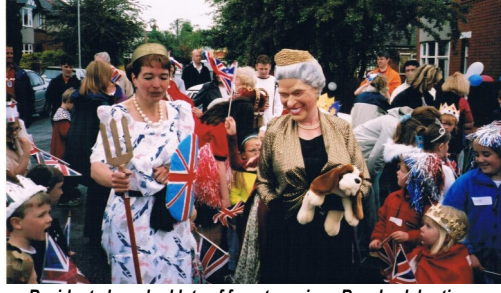
Residents have had lots of fun at previous Royal celebrations

Community Centre and on the field of Belgrave School on Saturday 4 June. You are invited to bring a picnic, a table and chairs or a blanket and relax and enjoy live music, competitions and