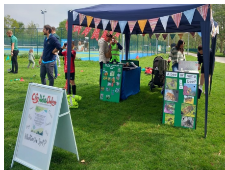
Find us in the park, we all wear bright yellow vests.

We work Wednesday mornings, 10 – 12. If you'd like to join us, all are welcome - tools and gloves provided.